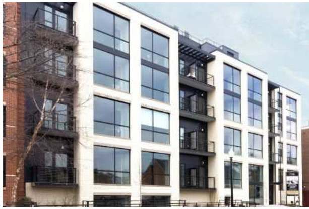
Experience Unparalleled Living in Logan Circle's Newest Boutique Condominium