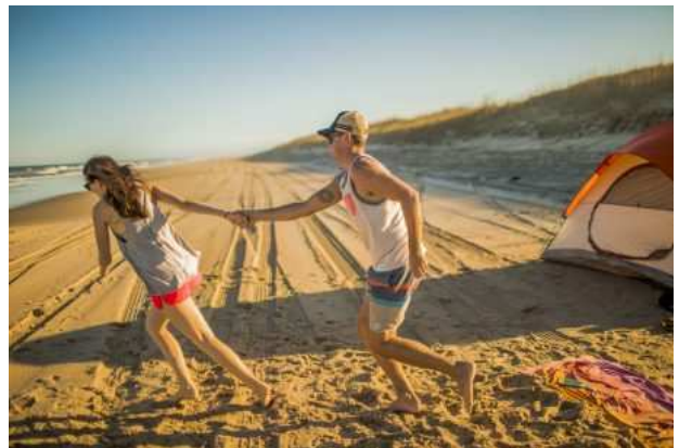
The Ultimate Road Map to Virginia's Best Beaches