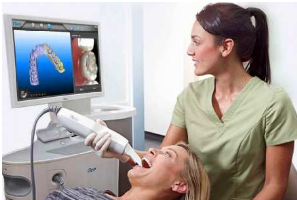
7 Things to Look for in the Modern Dental Office