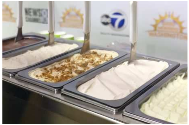
Guests Go Gaga for Gelato!